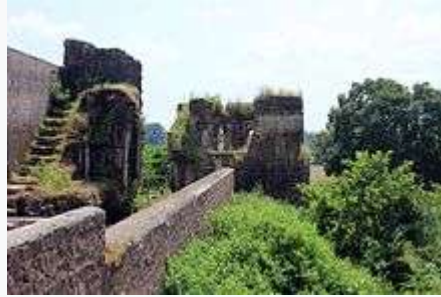
Fort Wall Islamnagar

The ruins of Islamnagar fort can be found running through the farmlands of Islamnagar.