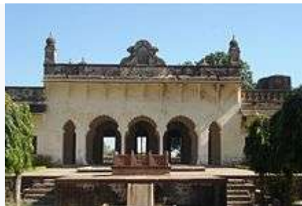
A part of the RaniMahal.

RaniMahal ("Queen Palace") is a double-storey zenana complex (female residence). It has a colonnaded Diwan-e-Aam.