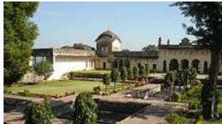
ChamanMahal with Garden.

ChamanMahal ("Garden Palace") is a red sandstone structure built by Dost Mohammad Khan. It is surrounded by gardens and fountains, and is ornamented with floral motifs. The architecture is a synthesis of the Malwa-Mughal architecture, with Bengali-influenced drooping eaves. The ruined palace has a Mughal water garden and a hamam (Turkish bath).