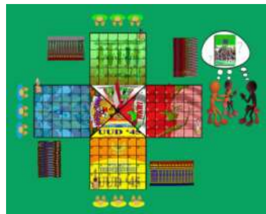
Figure 2. Media Dukasan Design